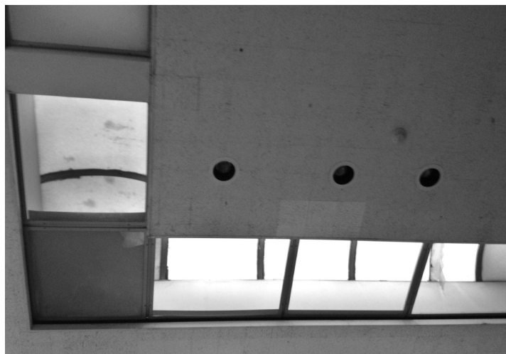
Damaged skylights at Mattlin Middle School

The current balance in this reserve fund is approximately $442,312 and we are proposing to utilize these funds to replace the skylights with associated roof reconstruction at Mattlin Middle School. The use of these funds will not impact the current or future tax levy.